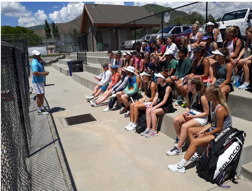
Training session during our highly popular summer junior program in 2019.