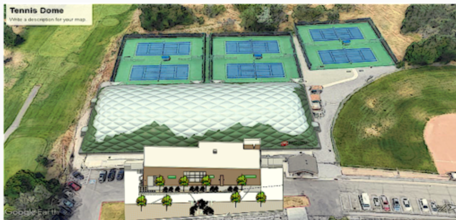
Aerial sketch of new clubhouse and Broadwell Air Dome at Wasatch Hills Tennis Center.