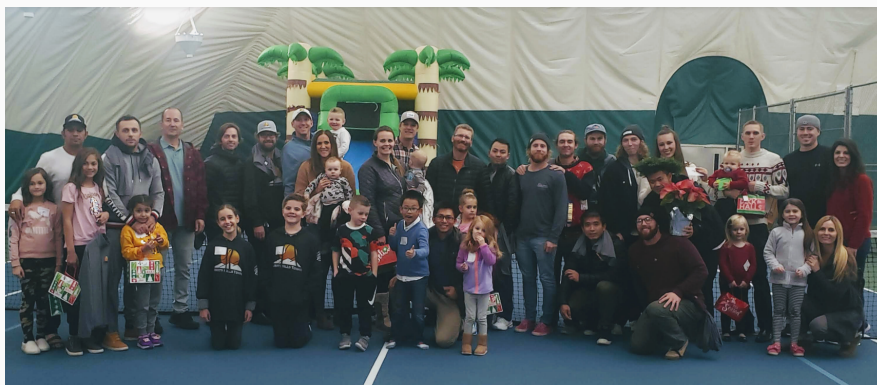
Some of the wonderful staff at Liberty Hills Tennis Christmas Party in 2019.