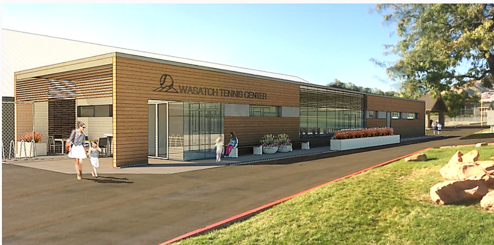
Rendering from EDA architectural firm of the upcoming and fully funded new clubhouse at Wasatch Hills, scheduled to be completed in 2021.