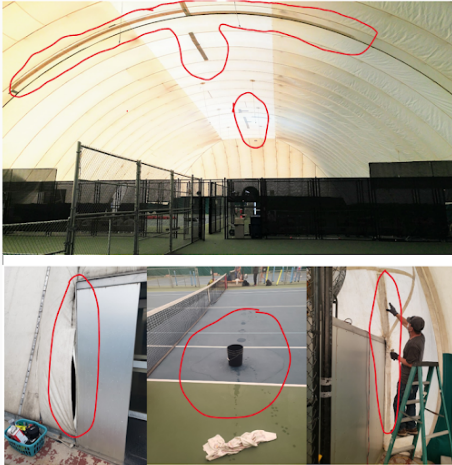
Current photos of patchwork, tears, and leaks of the worn-out bubble at Wasatch Hills Tennis Center.

Again, the cost of a year-round bubble is $1.1 million, and information about the proposed new facility called an “Air Dome” can be found under the section “Broadwell Air Dome.” Because Salt Lake City does not have the funds to purchase and install the bubble, beginning in 2018, a group of community members initiated a fund-raising effort to raise the needed funding to make this important addition to the Wasatch Hills Tennis Center a reality. Through the center’s tax-deductible 501(c)(3) foundation, $461,000 has been donated to this project by caring citizens and tennis enthusiasts who recognize its unique value to the community. Now we need your help, and that of many others, and we need it soon.