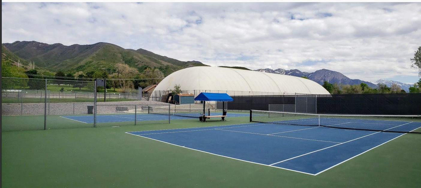
View of Wasatch Hills Tennis Center and surrounding foothills.

Historical sources say tennis originated in northern France in the 12th Century. At that time, the ball was struck with the palm of the hand; hence, the name jeu de paume ("game of the palm"). It is sincerely hoped readers will seriously consider opening their paumes in support of the worthy cause described in this packet.